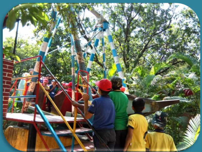
At Tikujini Wadi