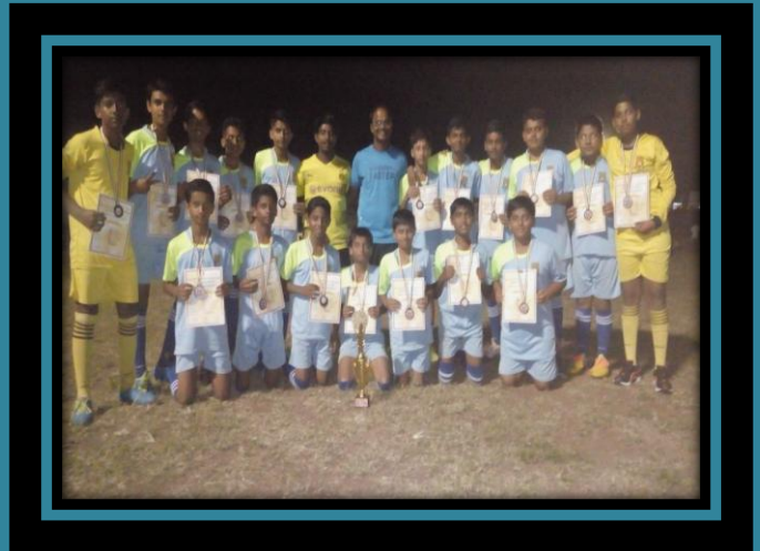
Football Team of NHPS- 3rd position in School State level Football Tournament