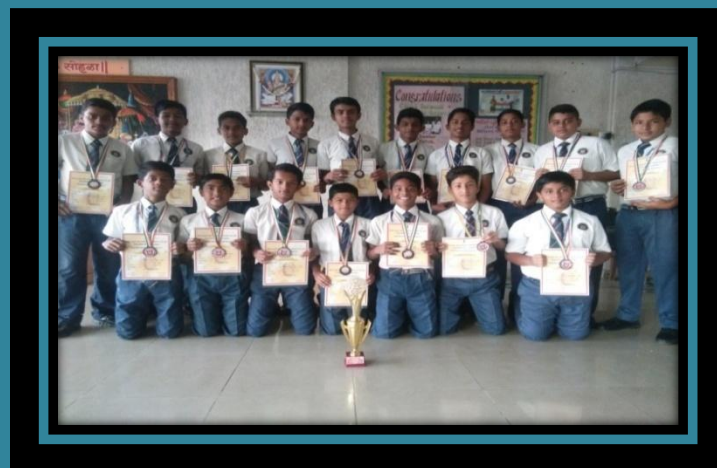
Winners of DSO FootBall State Tournament