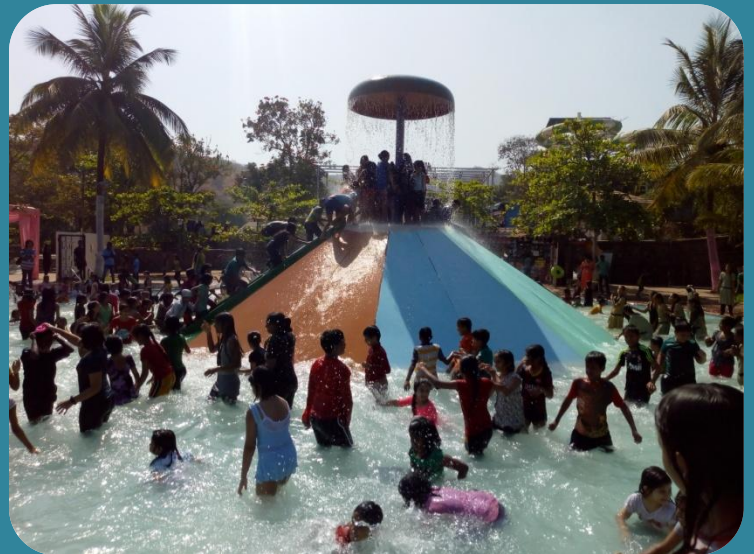
At Shangrila Water Park