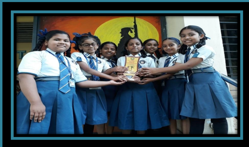
Winners of Handball Tournament at Amatuer Handball Association