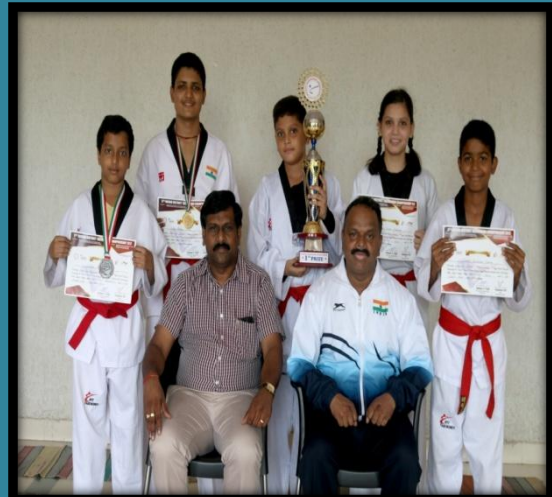
Winner of Raigad Taekwondo championship in 2017