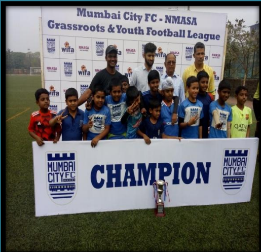
Winner of Mumbai city FC NMSA Football League