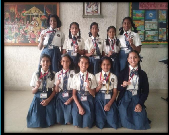
Girls Runner up Team under 12 yrs(girls)

Achievement of Handball Team at District level - Championship