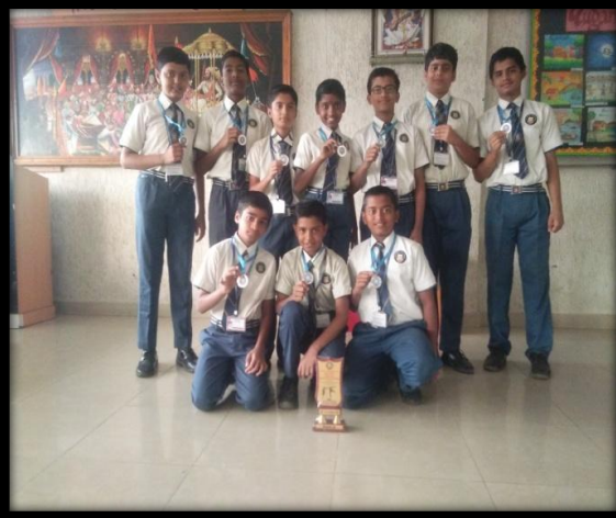
District level Handball Championship